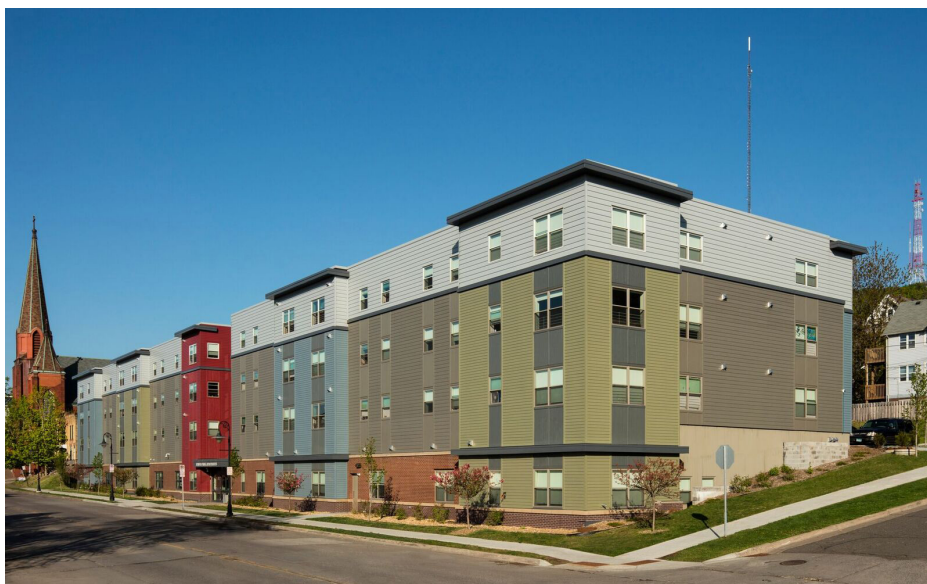
The Steve O'Neil Apartments, 115 W 4th Street in Duluth's Central Hillside.