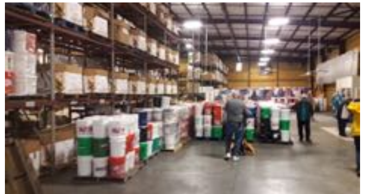
UMCOR flood buckets fill the Sager Brown Depot in Louisiana.