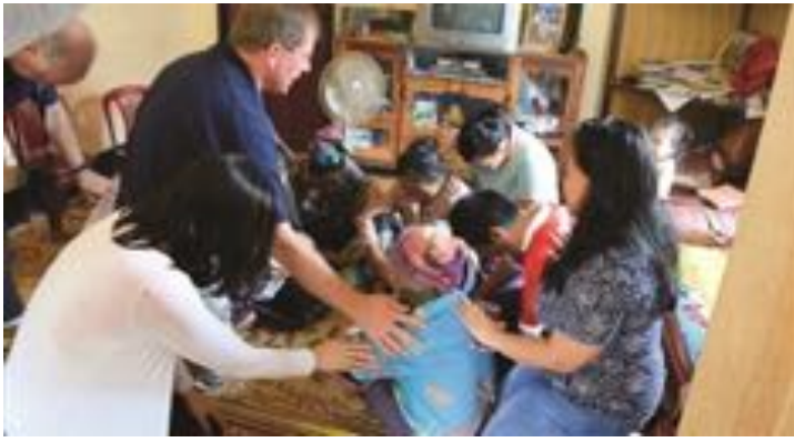
In Laos, a house church prays together.