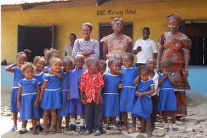
These nursery school children in Sierra Leone are the recipients of scholarships from OC Ministries (Operation Classroom), allowing them to attend school. Local primary and secondary students are also receiving scholarships from OC Ministries.