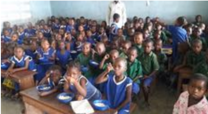
Children eating food from Feed My Starving Children at school in Sierra Leone.