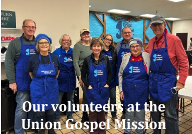
Our volunteers at the Union Gospel Mission